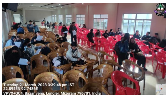
Figure 3: On-the-Spot Poetry Writing Competition