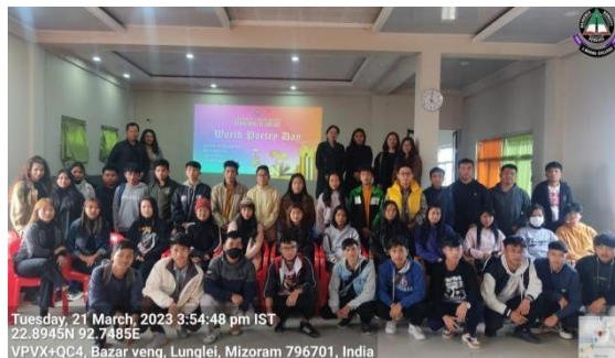
Figure 2: On-the-Spot Poetry Writing Competition Participants and Teachers