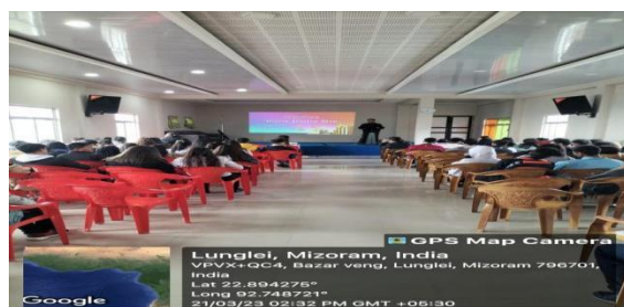
Figure 4: World Poetry Day Attendees